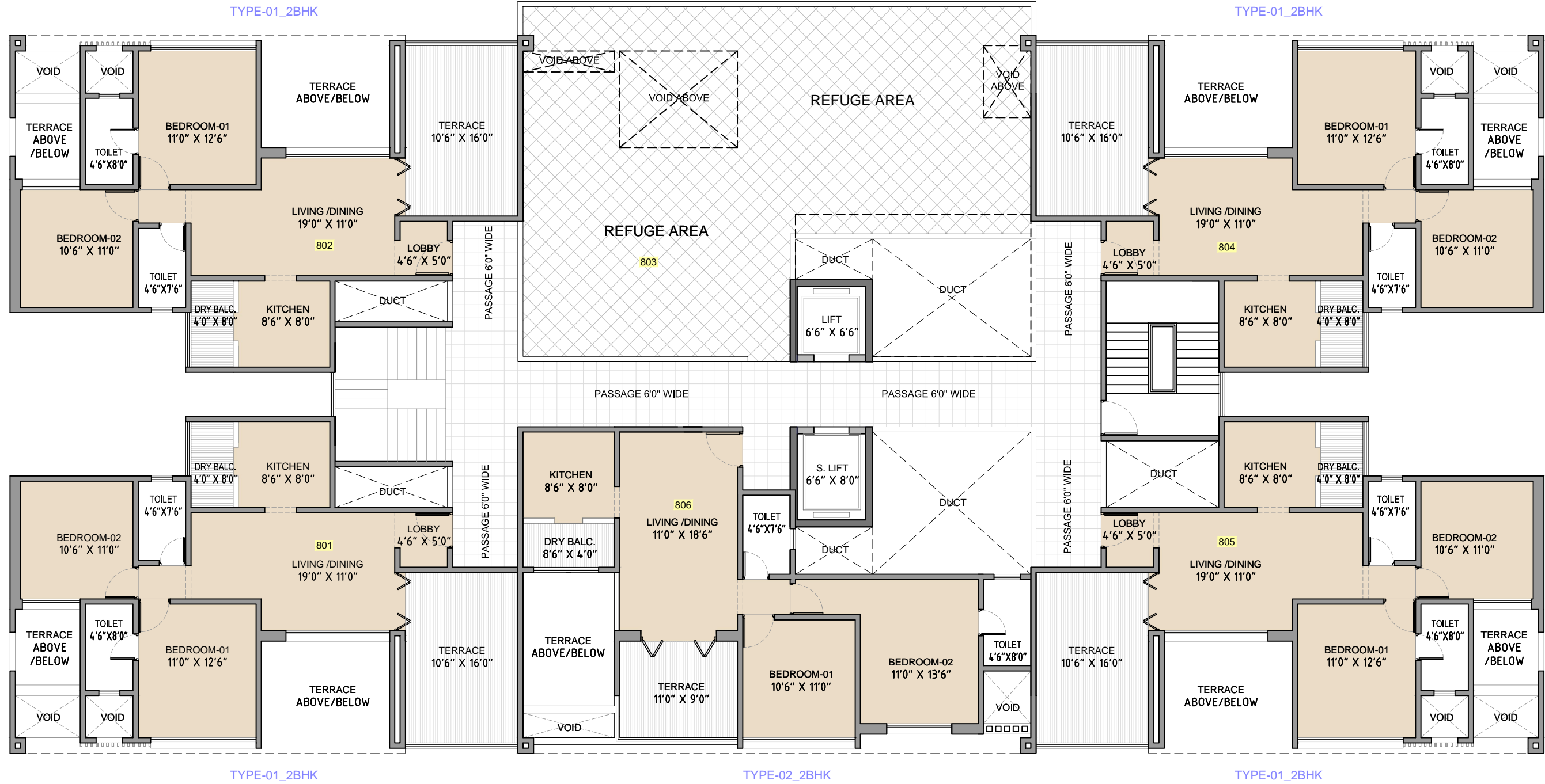
TYPICAL - EVEN FLOOR PLAN 8th FLOOR PLAN (REFUGE AREA) BUILDING - F