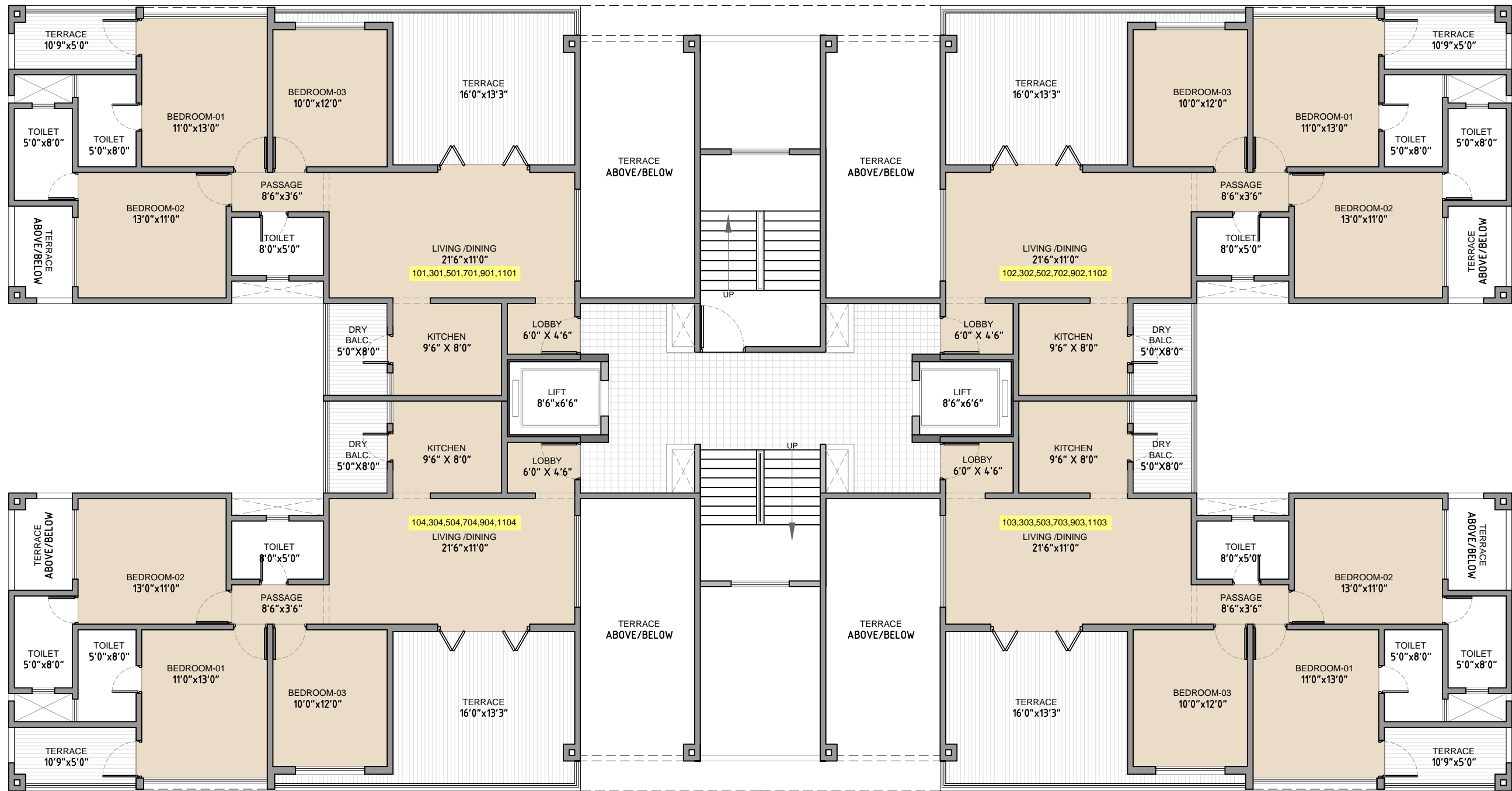
TYPICAL - ODD FLOOR PLAN 1,3,5,7,9,11th FLOOR PLAN BUILDING - E